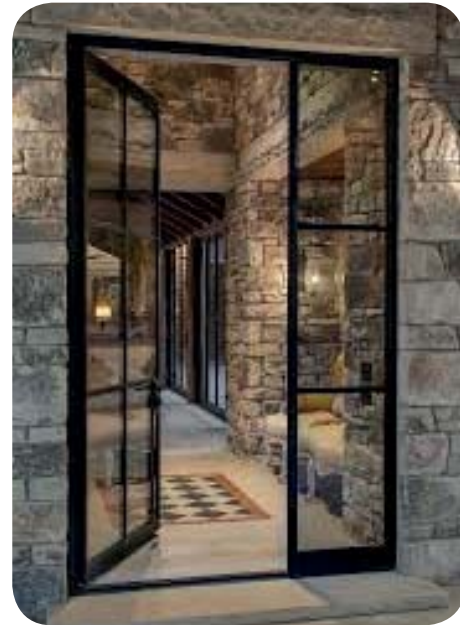
SLIM LINE PROFILE HERITAGE PIVOT DOORS